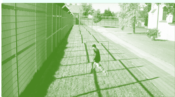
AIVA Intrusion Detection